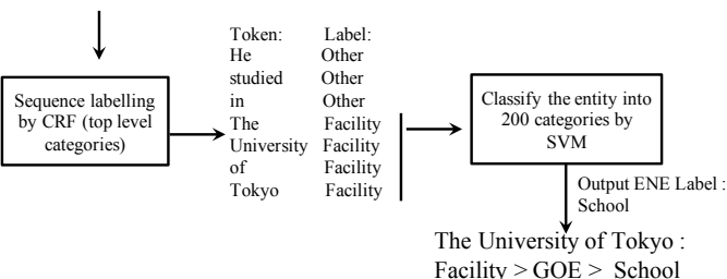
Figure 3: CRF+SVM based hierarchical classifier for FG-NER

Input sentence : He studied in The University of Tokyo.